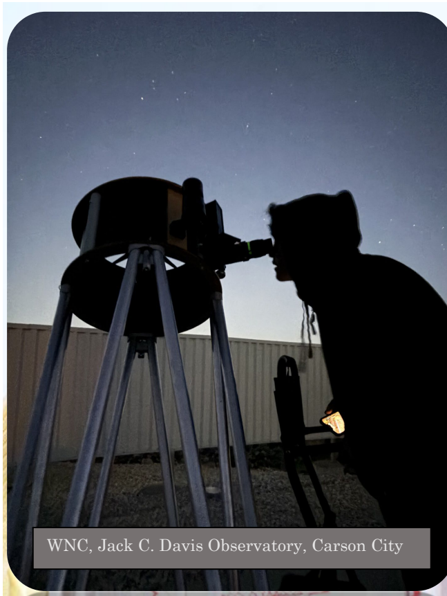
WNC, Jack C. Davis Observatory, Carson City

Support social, emotional, and mental health, address interrupted learning (Covid), recruiting, supporting, and retaining effective educators.