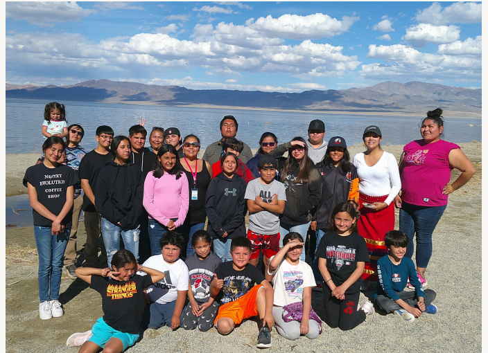
Group Picture near Walker Lake