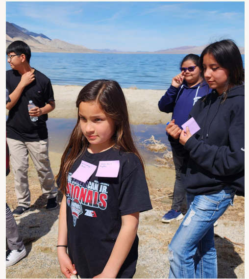
Learning about environmental programs in college