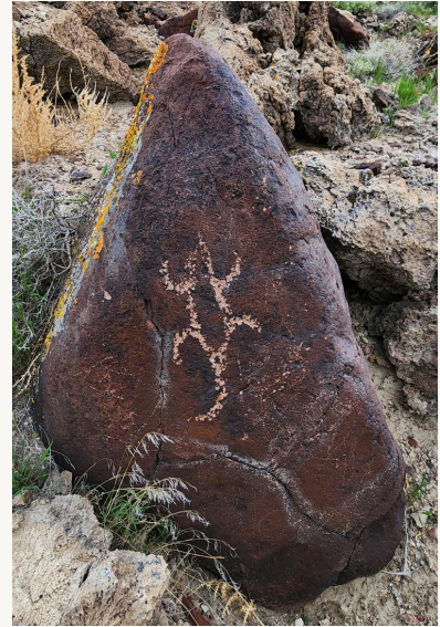
Petroglyph along Hidden Cave Trail