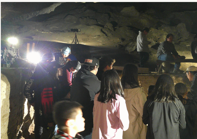
Youth examining inside Hidden Cave