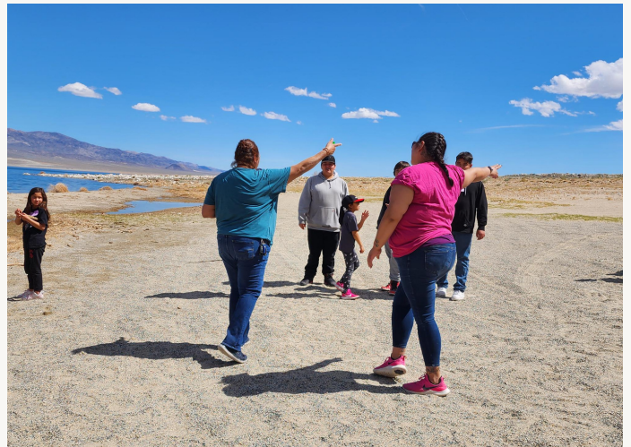
NYCP Coaches facilitating higher education activity with youth group