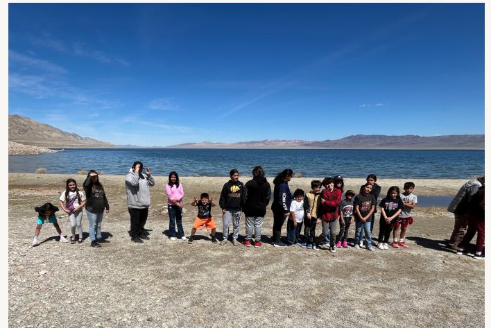
Youth members lining up for lunch!