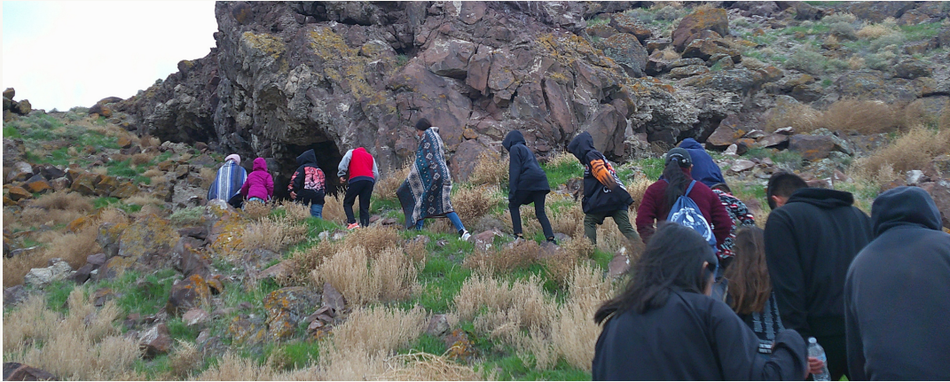
Youth hiking up to Hidden Cave with trail guide