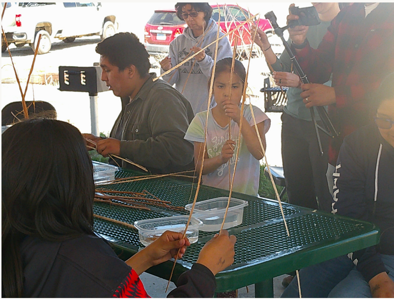
Youth learning how to do string-making using sinew from willow