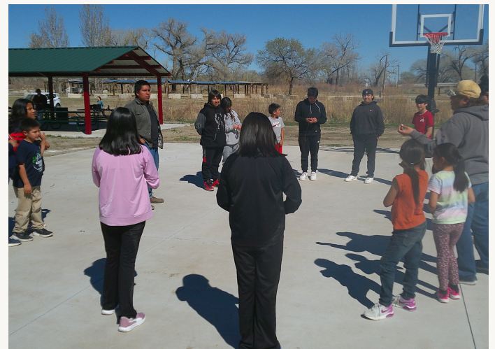
NYCP Coaches facilitating daily reflection activity with youth group