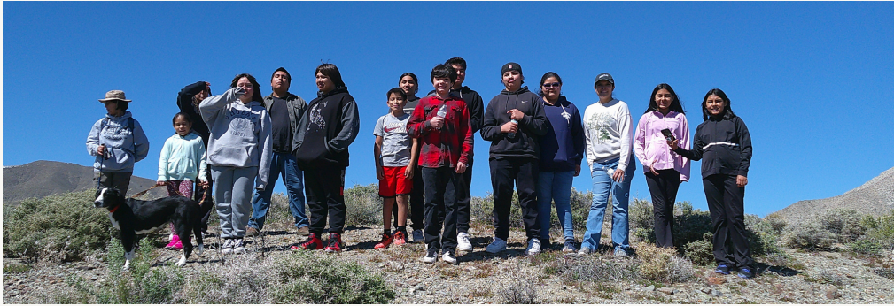
Youth hiking up the ridge near White Mountain