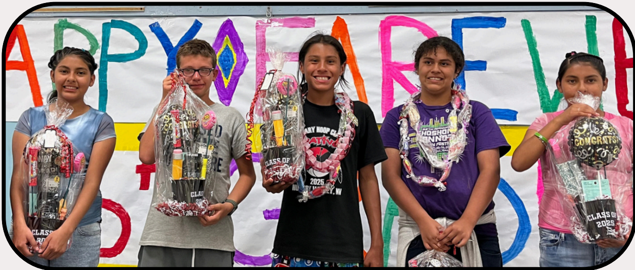
Schurz Elementary School 6 th Grade Graduates - Class of 2025